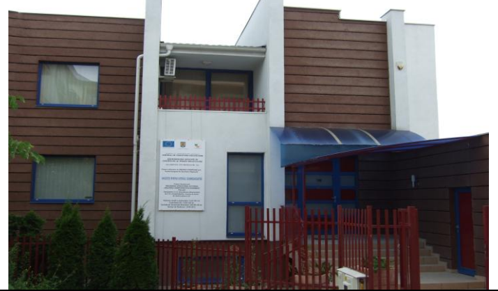
The new infrastructure aquired by this project for the CCD BIODIATECH Centre