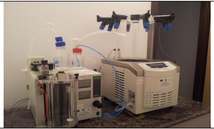
Instalation for microcapsules (E3) in the Laboratory of Microencapsulation