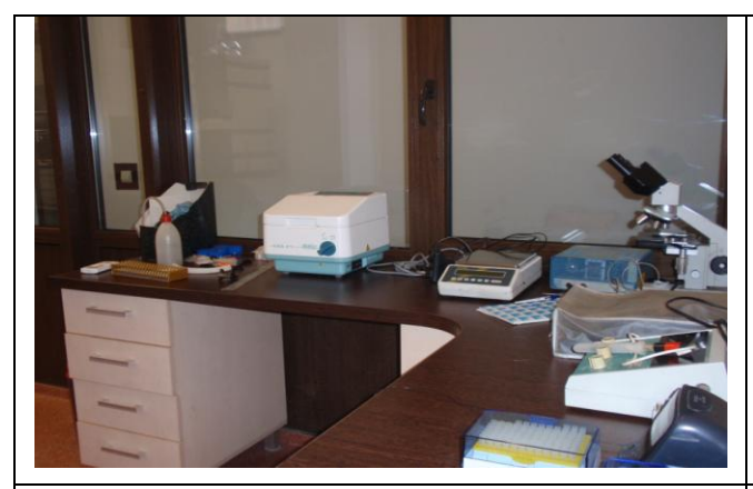
Laboratory of Metabolomics