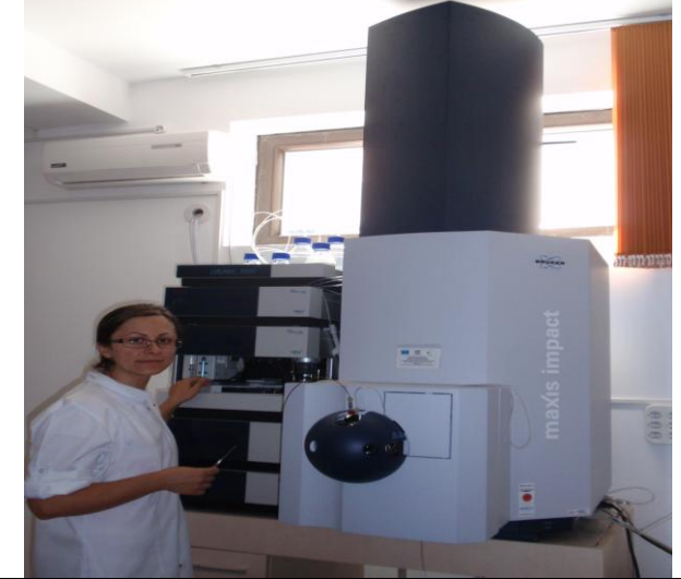
High performance Liquid Chromatograph coupled with triple quadrupol Mass Spectrometer /QTOF MS (E1) in the Laboratory of Metabolomics