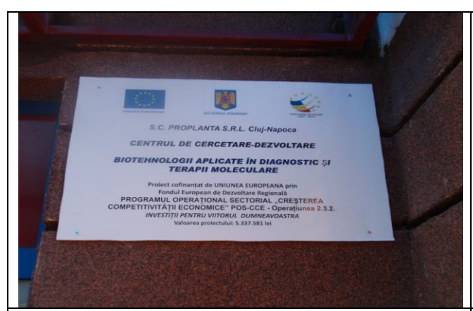
The final panel at the CCD-BIODIATECH entrance, with details about the project